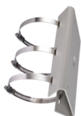
DS-1275ZJ-SUS Vertical Pole Mount