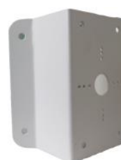
DS-1276ZJ-SUS Corner Mount