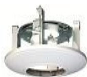
DS-1227ZJ In-ceiling mount