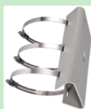
DS-1275ZJ Vertical pole mount