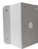
DS-1276ZJ-SUS Corner mount