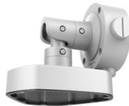
DS-1283ZJ Wall Mount (3-axis Adjustment)