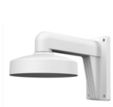
DS-1473ZJ-135 Wall Mount