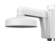
DS-1473ZJ-135B Wall Mount with Junction Box